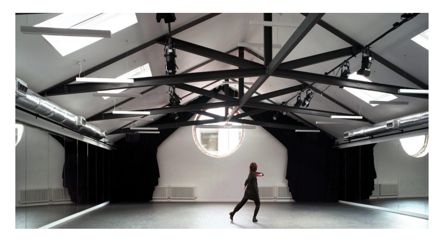
The £4.1 million creative hub in Stratford, east London, contains dance studios, recording suites, and teaching and events spaces.

The Talent House is a new £4.1 million state-of-the-art creative hub located in Stratford, east London, as the home of East London Dance and national youth music organisation UD Music. It was opened by London mayor Sadiq Khan in July 2022.