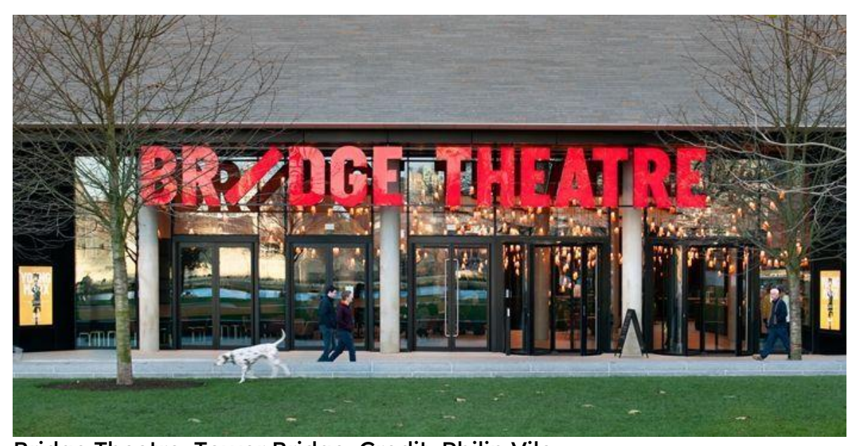
Bridge Theatre, Tower Bridge.

Region: London: RIBA Regional Awards 2018, Haworth Tompkins, Theatre, Tower Bridge