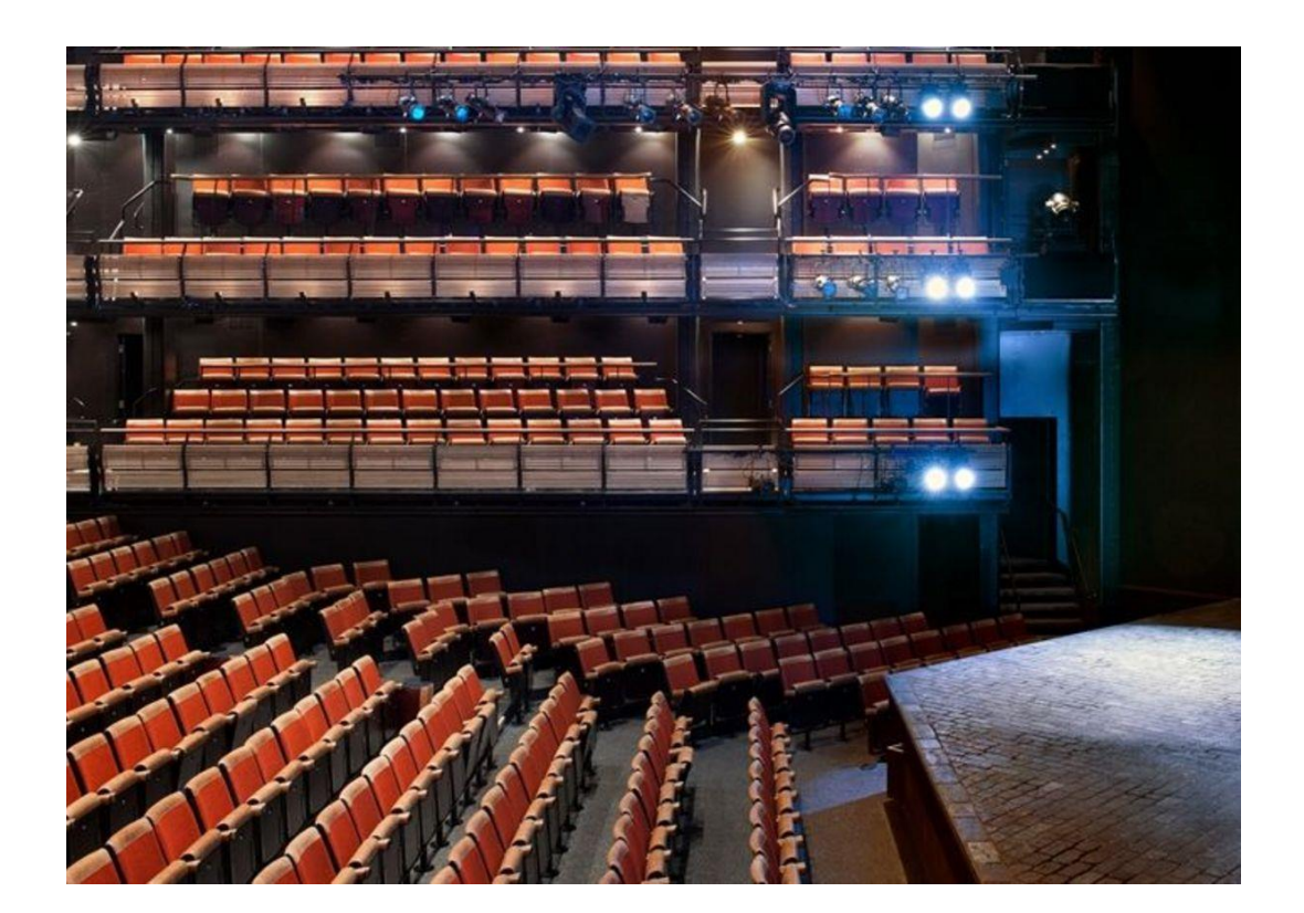
Bridge Theatre, Tower Bridge.

The auditorium materials palette is simple but warm with dark brown/black painted steel for the main structure, natural oak slats for the tier fronts, black recycled rubber flooring and rich burnt orange wool and tan leather upholstery. The design allows for multiple configurations of stage and seating. With no fly-tower the theatre has a moveable floor system which was invented and developed for the project.